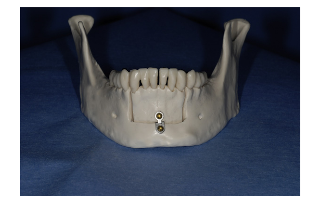
Fig. 1. The horizontal osteotomy is made about 5 mm inferior to the apices of the teeth. A joint plate is loosely fixed with screws before completion of the vertical osteotomies.

The DO group consisted of 19 patients (mean age 35.2 years, range 17.8-58.8 years) who had orthodontic treatment in combination with DO of the anterior mandibular alveolar process as described by Triaca et al.<sup>5</sup> No additional mandibular surgery (genioplasty, BSSO) was performed. In 16 patients, the osteotomy for the DO was between the lower canine and first premolar, and in the remaining 3 patients it was between lower lateral and canine. Additional maxillary surgery was accepted and performed in 5 patients. Two patients had an additional one piece Le Fort I osteotomy, two others a surgically expansion assisted rapid maxillary (SARME), and one a distraction of the maxillary anterior alveolar segment in the DO group. No syndromes, clefts, traumas, or other abnormalities were accepted. The