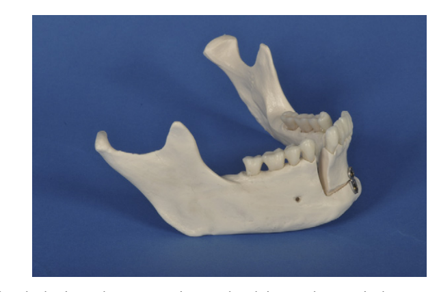
Fig. 2. After the horizontal osteotomy is completed, incomplete vertical osteotomies are made mostly between the canine and first premolars. The vertical osteotomies are then completed, the mandibular anterior alveolar segment is then mobilized with a chisel, and the screws holding the plate are tightened.

The DO procedure was performed as described by Triaca et al.<sup>5</sup> and illustrated in Figs. 1 and 2. Prior to surgery, the interroot space of the teeth next to the vertical osteotomies is increased by tipping them orthodontically. The desired new anterior position of the anterior alveolar segment has to be defined by the orthodontist and surgeon, from which the required position of the hinge axis is derived. The surgery